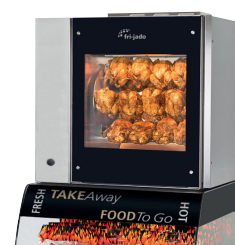
Space Saver with TDR5 M