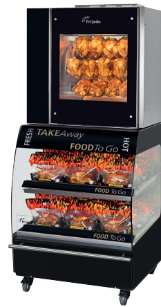
Space Saver with TDR5 S

The Fri-Jado Space Saver is a prime example of effective use of floor space. By combining a TDR 5 rotisserie and a MDS 34-2 Self-Serve grab-and-go merchandiser, you save valuable floor space.