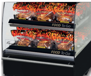
MD 86-2 self serve heated merchandiser

* see separate spec sheets for more information on the 5-spit rotisseries