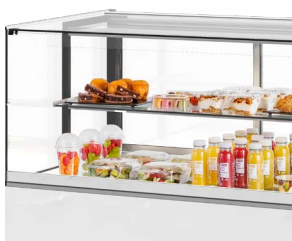
Two presentation levels