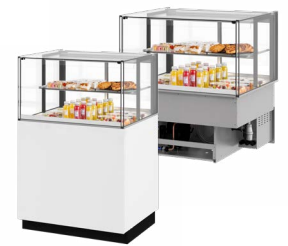
Models on underframe or drop-in version