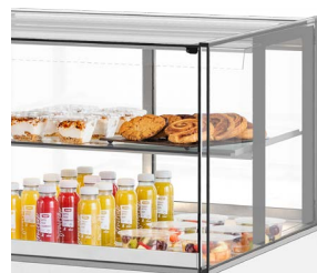
Maximum food visibility